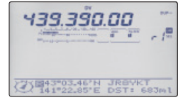
▲Direction and distance to RX station

The IC-9100 has a GPS button on the front panel. Your position data is shown on the display and can be sent to other stations in DV mode*2. When a calling station transmitting GPS data via DV mode is received, the IC-9100 displays the distance and direction to the station. GPS A mode is supported.