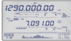
▲Simple band scope screen

The IC-9100 covers 100W on HF, 50MHz and 144MHz, 75W on 430/440MHz bands and 10W on the 1200MHz band.*1 The radio simultaneously receives two different bands (1. HF/50MHz + VHF/UHF, 2. VHF + UHF, 3. 430/440MHz + 1200MHz) and works as if there are two independent receivers in one radio. For example, you can arrange a 7MHz schedule QSO using a D-STAR repeater on VHF/UHF band, while watching 7MHz band activity using the simple band scope.