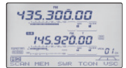
▲Satellite mode screen

The satellite mode synchronizes the uplink (transmitting) and downlink (receiving) frequencies and shifts the frequencies in the same tuning step. 20 alphanumeric satellite memory channels store frequencies, operating mode and tone settings for quick setting.