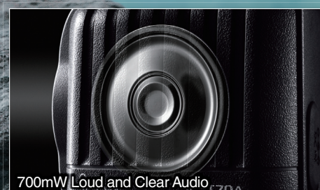
700mW Loud and Clear Audio