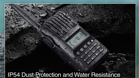
IP54 Dust Protection and Water Resistance