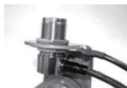
Installed lower part