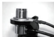
Installed upper part

Please note that if you use it with 30mm, SWR deteriorates and the resonance frequency becomes low, and the frequency may not be adjusted.