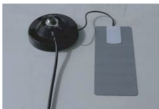
Installation on magnet bracket